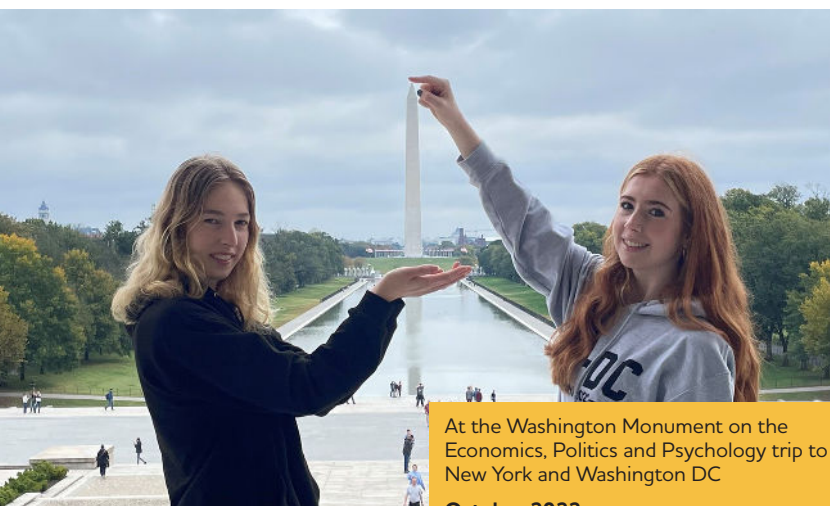
At the Washington Monument on the Economics, Politics and Psychology trip to New York and Washington DC