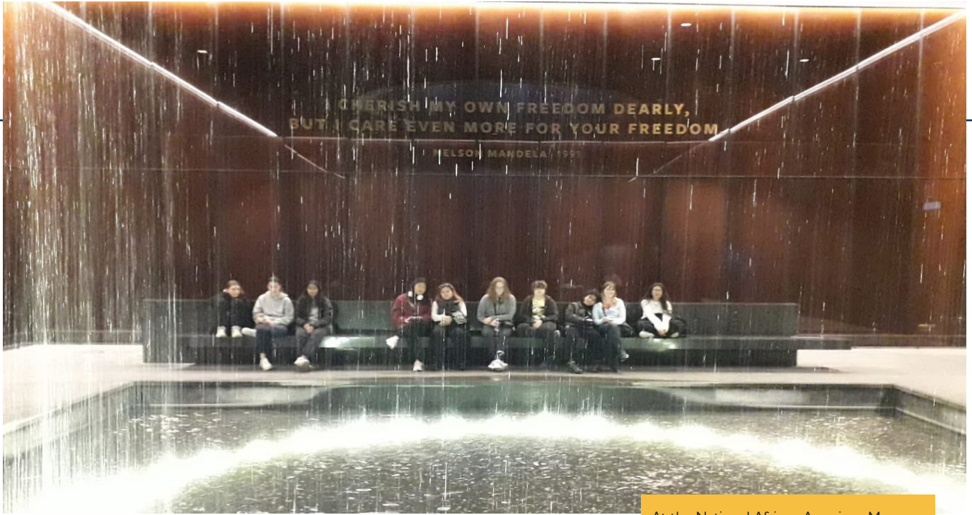
At the National African American Museum of History and Culture on the Politics, Economics and RS visit to New York and Washington DC October 2022