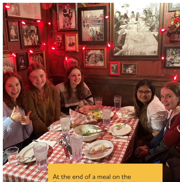
At the end of a meal on the Economics, Politics and Psychology trip to New York and Washington DC October 2022

A former student studying Business Economics at Westminster University