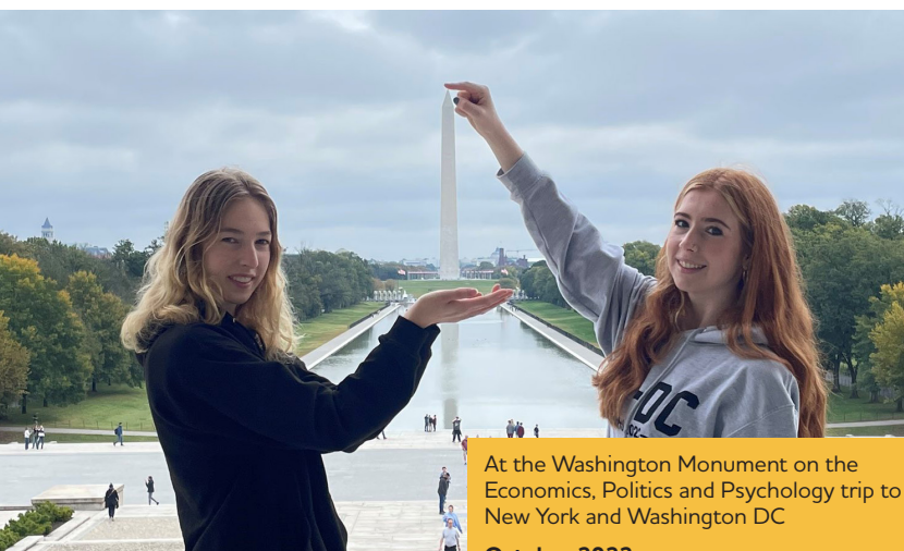
At the Washington Monument on the Economics, Politics and Psychology trip to New York and Washington DC October 2022