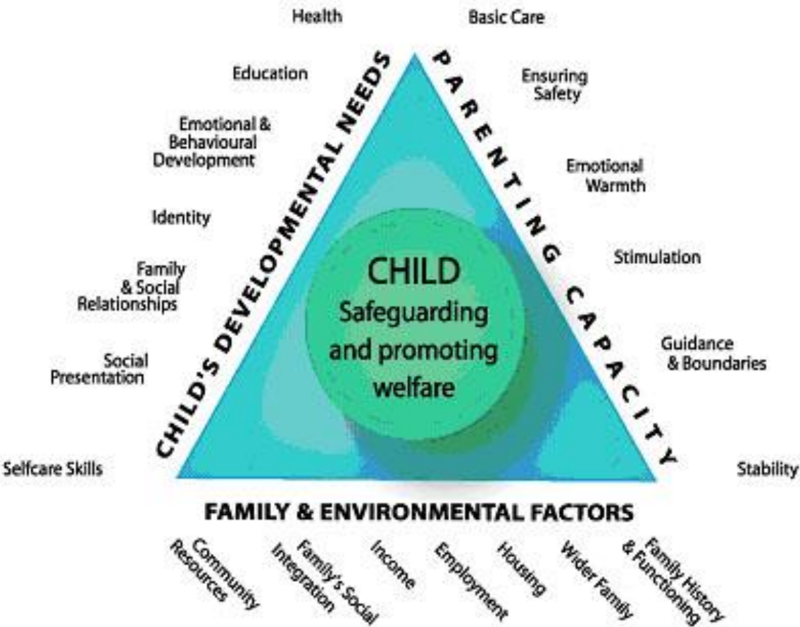
Figure 1 – The Assessment Framework 50