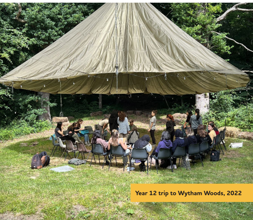
Year 12 trip to Wytham Woods, 2022

Biology A Level will be of interest to you if you are curious about the world around you, from the cellular level, to the whole organism, to the interactions taking place within ecosystems. It is essential if you are considering the study of Medicine, Veterinary Medicine, or Biology-related subjects at university. It combines well with many other science-related subjects including Chemistry, Physics, Maths, Psychology and Geography. To succeed with the study of Biology A Level, you will also need a firm grasp of key mathematical concepts and an interest in carrying out statistical analysis of results. In addition, you will be required to build on your GCSE Chemistry knowledge during topics that focus on Biochemistry. However, most importantly we would like you to study Biology because you thoroughly enjoy the subject and love trying to make sense of the world around you!