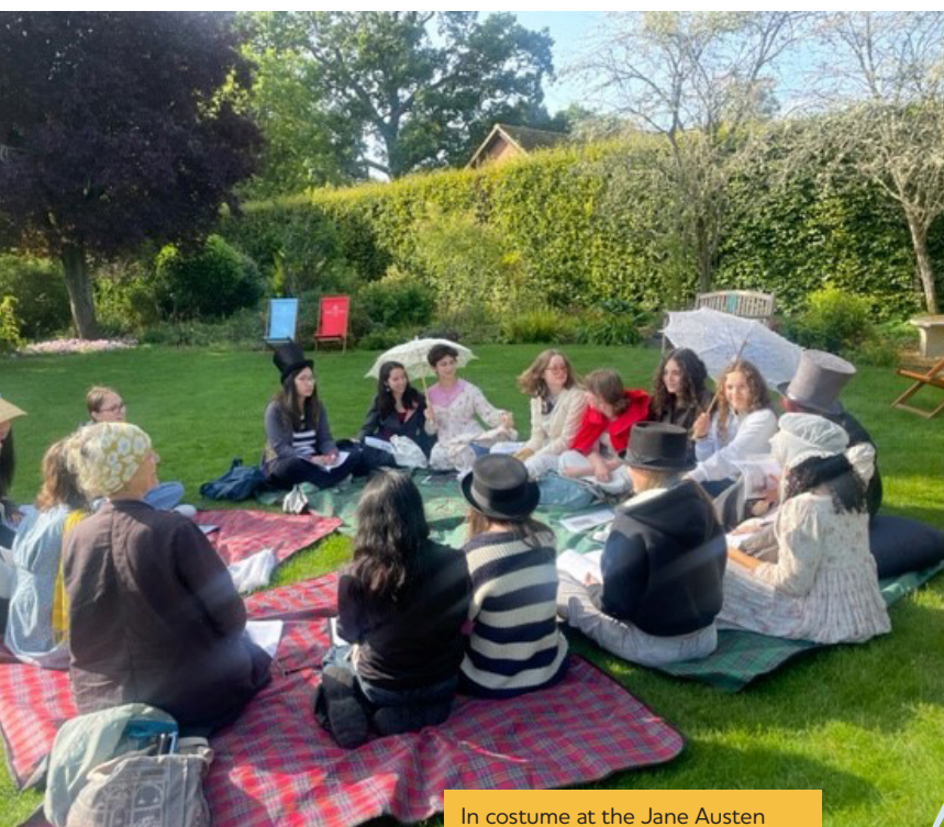
In costume at the Jane Austen museum, 2023