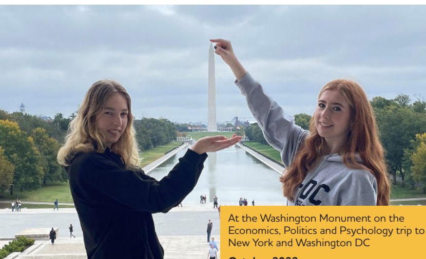
At the Washington Monument on the Economics, Politics and Psychology trip to New York and Washington DC October 2022