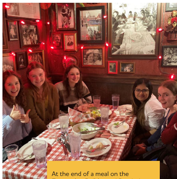
At the end of a meal on the Economics, Politics and Psychology trip to New York and Washington DC October 2022

A former student studying Business Economics at Westminster University