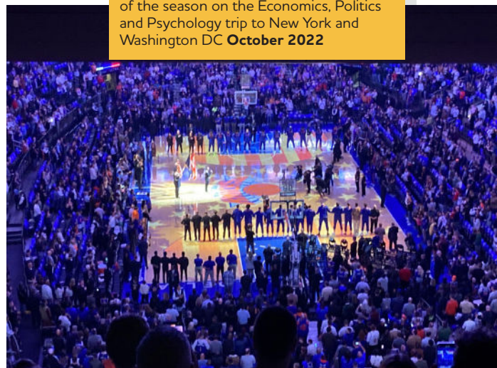
At Madison Square Garden watching the New York Knick's first basketball game of the season on the Economics, Politics and Psychology trip to New York and Washington DC October 2022