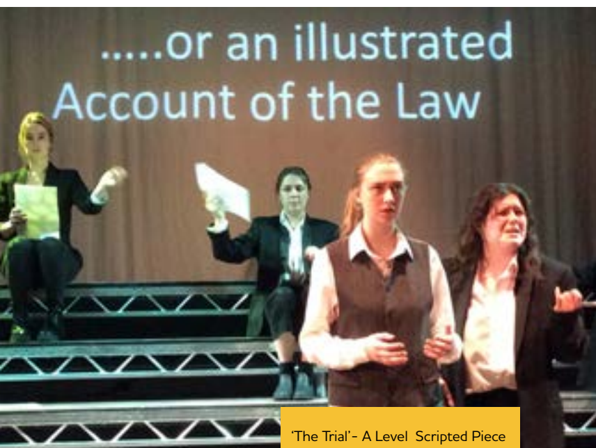
'The Trial' - A Level Scripted Piece

They will perform a monologue or duologue from one performance text, and a group performance of a key extract from a different performance text.