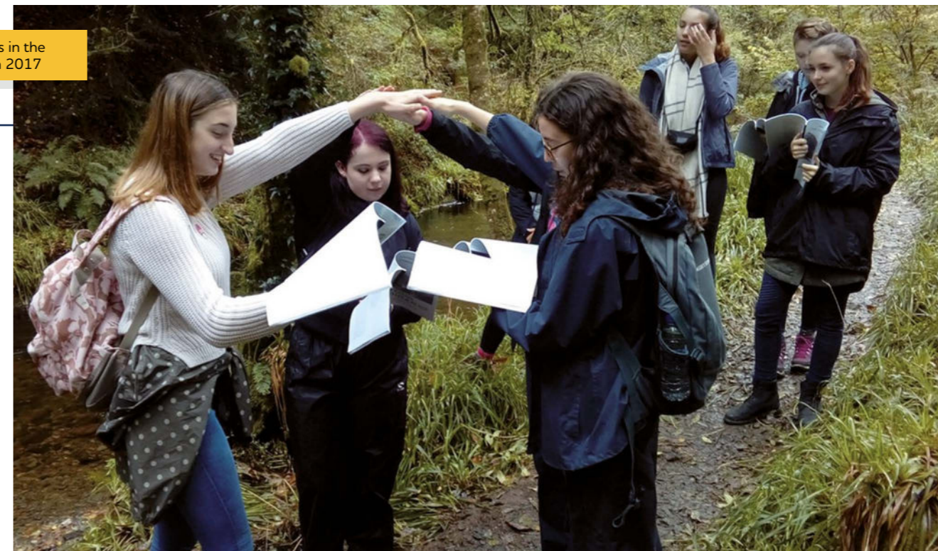
Poetry readings in the woods - Devon 2017