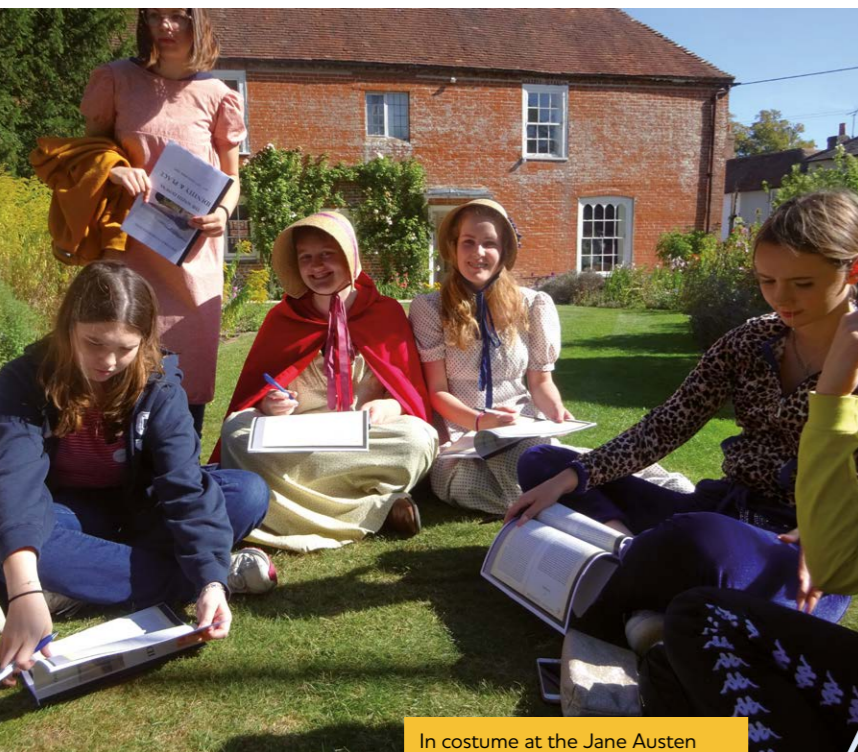
In costume at the Jane Austen museum - South Downs 2019

Students choose English Literature A Level for all kinds of reasons. Combining an English course with Maths and Science options enables you to develop the skills of highly effective communication you will use in your future careers. If you choose to specialise in Arts, Humanities or Languages, the shaping of arguments, facility with ideas and precision of response fostered in A Level English Literature complements the skills and interests you are pursuing elsewhere. If English is your first love, then you don't need us to tell you of the thrill of getting caught up in a great story, being moved by a poem, or laughing (or crying) as a play unfolds on stage. You are studying English Literature because it matters to you – a lot. As a subject, we have a very high retention rate between Years 12 and 13, and many students have gone on to study English at university, including Cambridge and Oxford. Our results are consistently outstanding, and we pride ourselves on the success of all of our students.