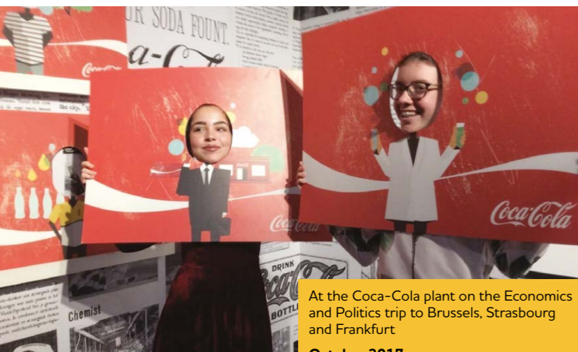
At the Coca-Cola plant on the Economics and Politics trip to Brussels, Strasbourg and Frankfurt October 2017