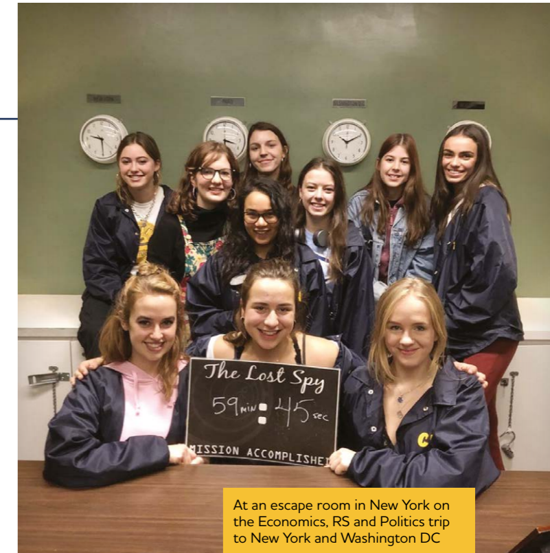
At an escape room in New York on the Economics, RS and Politics trip to New York and Washington DC