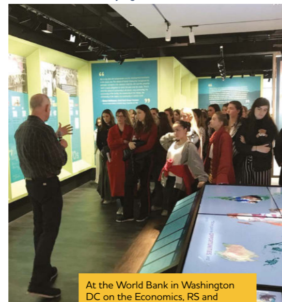
At the World Bank in Washington DC on the Economics, RS and Politics trip to New York and Washington DC

A former student studying Business Economics