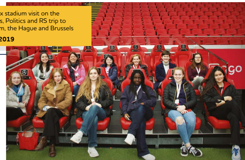
At the Ajax stadium visit on the Economics, Politics and RS trip to Amsterdam, the Hague and Brussels October 2019