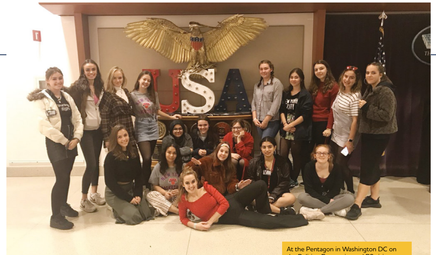
At the Pentagon in Washington DC on the Politics, Economics and RS visit to New York and Washington DC October 2018