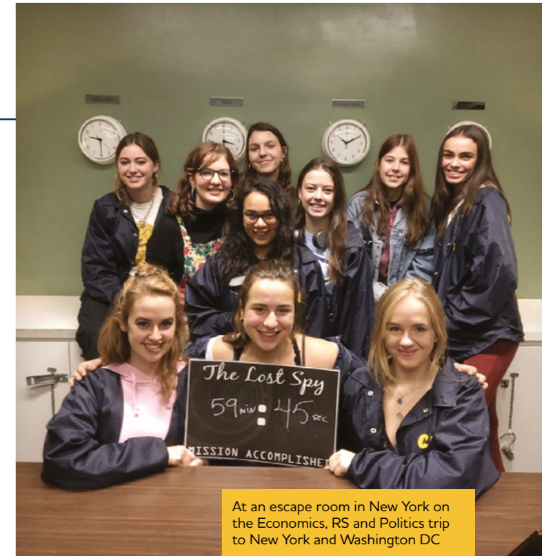
At an escape room in New York on the Economics, RS and Politics trip to New York and Washington DC