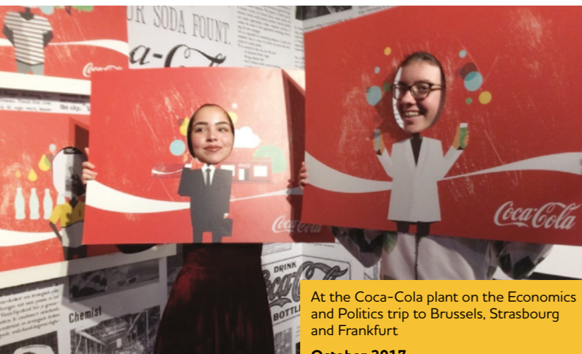
At the Coca-Cola plant on the Economics and Politics trip to Brussels, Strasbourg and Frankfurt October 2017