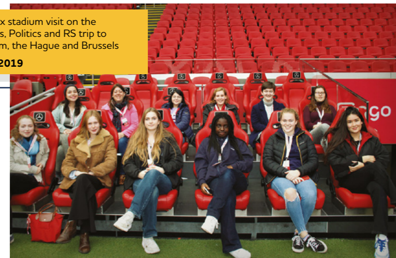
At the Ajax stadium visit on the Economics, Politics and RS trip to Amsterdam, the Hague and Brussels October 2019