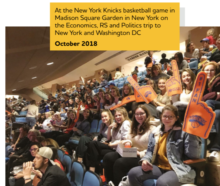
At the New York Knicks basketball game in Madison Square Garden in New York on the Economics, RS and Politics trip to New York and Washington DC October 2018

Students are encouraged to read a quality newspaper, especially the business section, from one of The Times, The Financial Times (which is free at school on-line), The Guardian, The Independent (on-line) and the Telegraph. On a Sunday, The Sunday Times, and The Observer are worth reading and there are many quality television and radio programmes that are worthwhile. These include, subject to changes in programming: