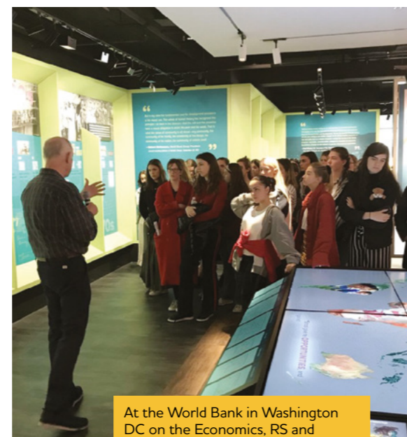
At the World Bank in Washington DC on the Economics, RS and Politics trip to New York and Washington DC

A former student studying Business Economics at Westminster University